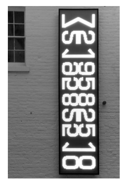
Thomson & Craighead, Hello World (2014)

Such work opens the question of how to draw on statistical data without only repeating the affective stun of Hutton's image. An immediate reaction invoked by the work is to be struck with awe at the relation between oneself and immense global scales, an effect that could be described as the 'Anthropogenic sublime'. This opens the question however, of 'what next?' – how can this impact be drawn upon and extended without being instantiated as a limit? It is here that the aesthetics of the interface is important - aesthetics not as art's description by philosophy, but as the (not entirely exhausted by human) aesthesis of sensing, considering aesthetic experience as structured by material regimes, and having political force - What kinds of subjectivities could be addressed by, modulated and organised around this encounter?