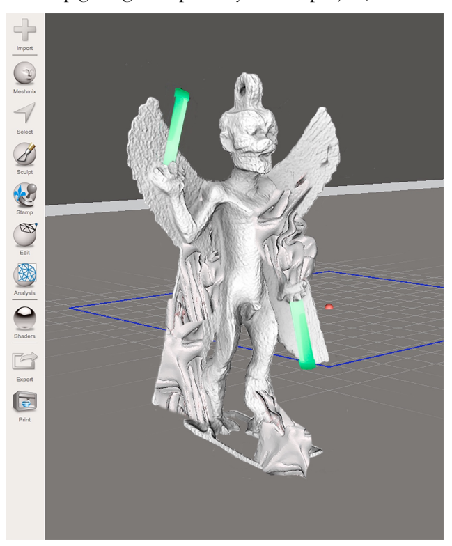
Andy Weir, Pazu-goo: 3D Printed Deep Geological Repository Marker for a Future Posthuman Palaeoarcheologist (c.700 BC -4.6 \times 10^9 \text{ AD} ), courtesy the artist

the deep geological repository marker project, addressed to the future.