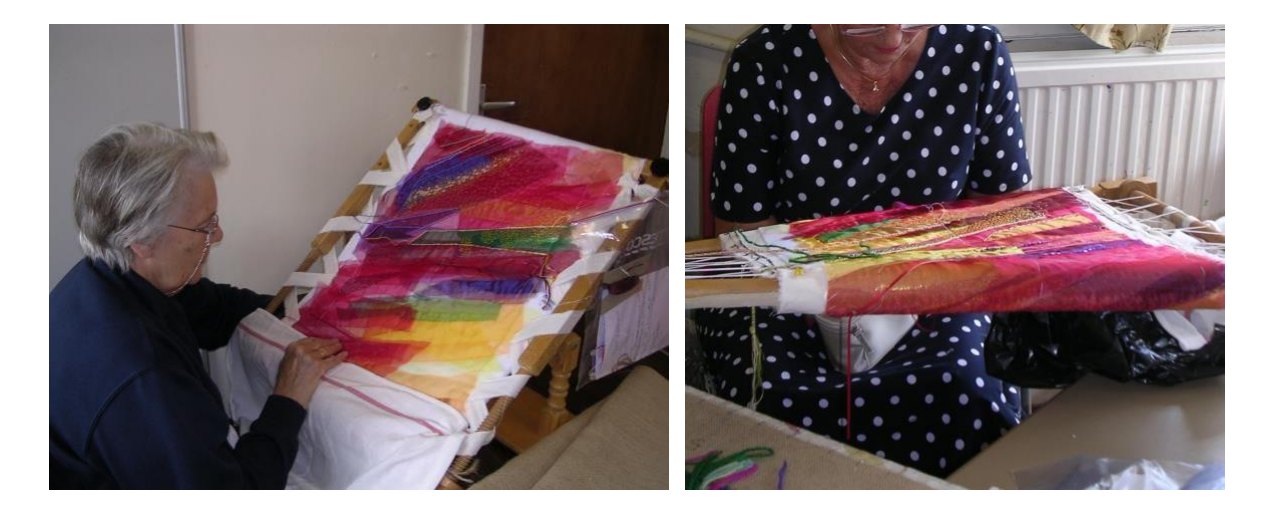
Figures 5 & 6: One participant contributing to a panel that is later taken on by another, who continues alone and completes it.

Skills are pooled and used collaboratively. It is possible to add a few stitches to a panel and feel that a contribution has been made, without having to commit to finishing what has been started as in due course someone else will continue the task (see Figures 5 and 6).