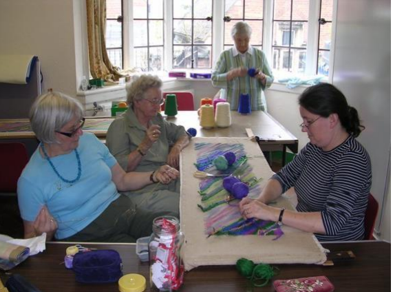
Figure 10: Independent tasks mean a participant can be present to benefit from being with the group but work alone in a private space.