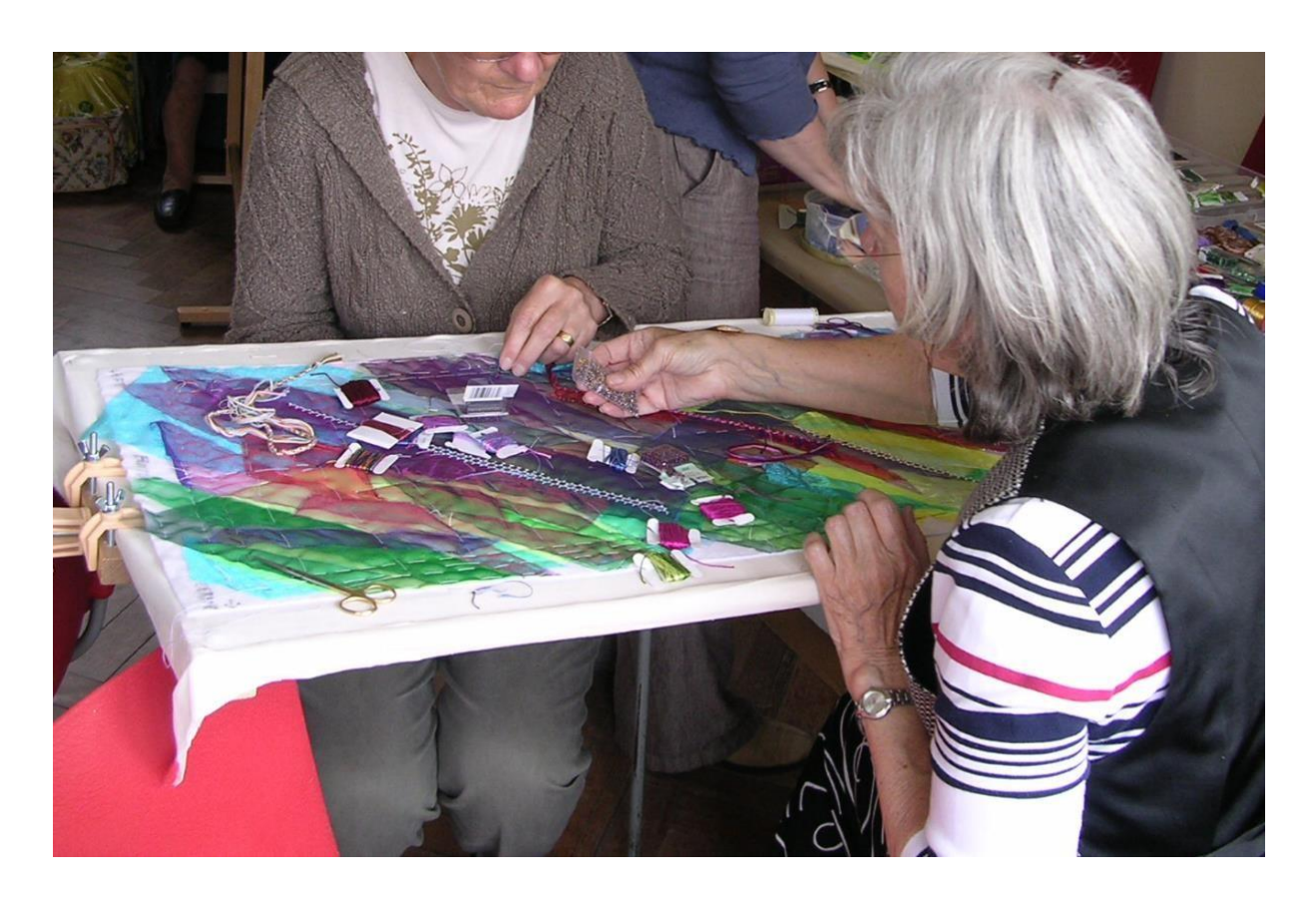
Figure 7: 'Multiparty discussion': participants working together on the same piece of work.

to contribute to a jointly negotiated whole [...] working together to produce shared meanings' (Coates 1988: 112–13). 'Speech' and 'speakers' could easily be replaced here by 'stitching' and 'embroiderers'; the embroidery project accommodates the different abilities and experiences of each participant in a 'jointly negotiated whole'.