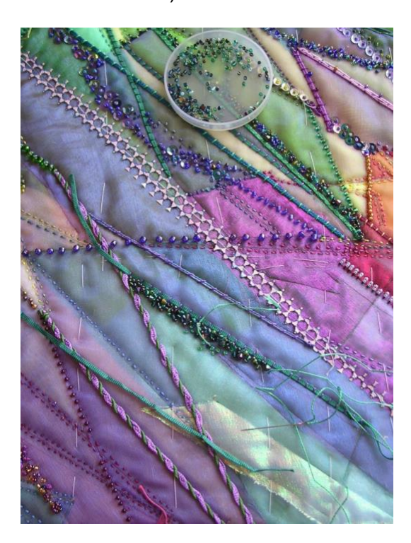
Figure 1: Detail of one of the embroidery panels showing the medley of layered colours, embroidery stitches, beading and embellishments: 'a continuous chorus' of short tasks that allow for frequent interruptions without disrupting either the visual effect or the modus operandi of the project.

Broken down into short and simple, or repetitive and monotonous tasks. Both methods require only a minimal level of attention. They are easy-to-remember, automated sequences of gestures: thread winding, cord making, seeding, background filling in a uniform colour, tacking, finishing loose ends. The start and stop points for the tasks are either tightly contained in a small space, or a short time lapse. Alternatively it might be a section of a larger, tedious task that is easier to work through with frequent interruptions that break the monotony. The design of the working method takes into account and allows for the distraction of conversation. (Author's notes 2008)