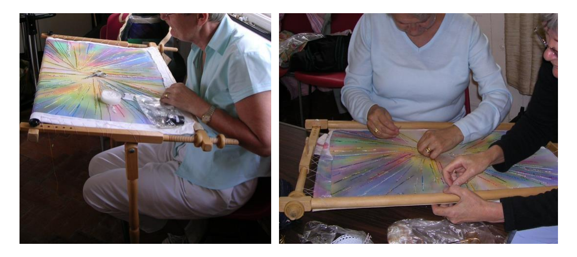
Figures 3 & 4: One participant works alone on her panel, and during a different session works together with another participant on the same piece.

The embroidered panels can be worked on by two or more people interchangeably at the same time, or consecutively (as in Figures 3 and 4).