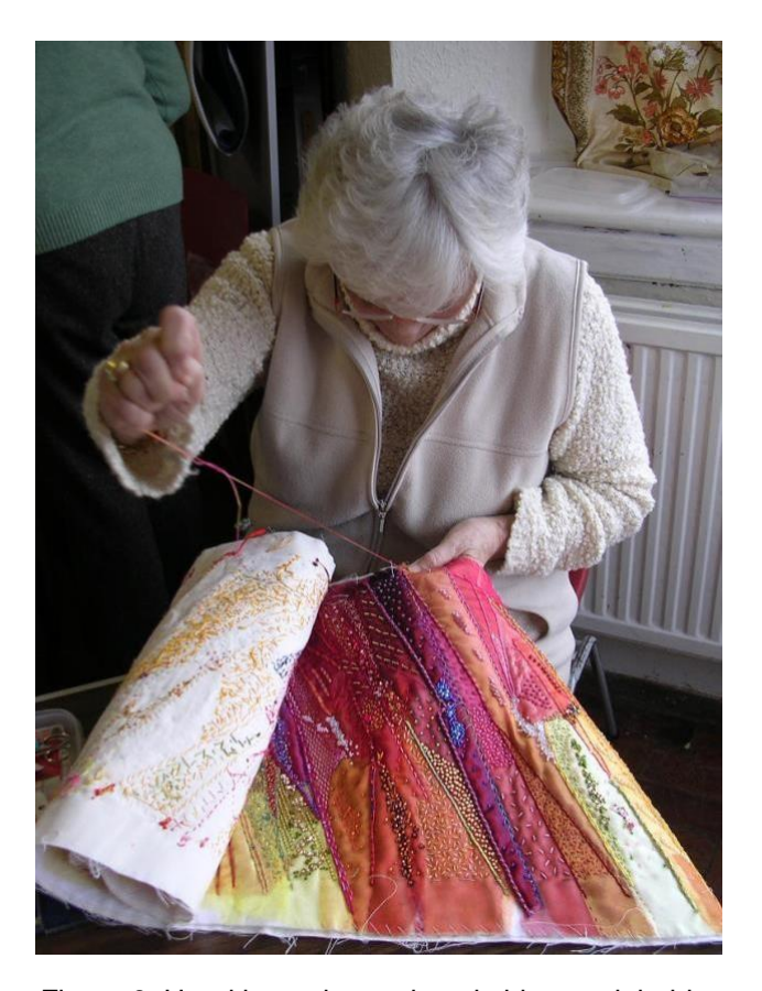
Figure 9: Head bowed over the stitching work held close to the torso.

space. One can metaphorically detach oneself from one's surroundings; time and space that is otherwise filled can thus be retrieved for the self. Hand-stitched work can easily be contained to the scale of the body; the work is usually within easy reach of the hands. Held against the torso, drawing the eyes downward, stitching shapes the body into a studious, inward-looking posture, with the head bowed over the work (see Figure 9). Containing the activity within this manageable scale of the body helps to restore a sense of control over larger, rambling, greedy external events. Thus absorbing the individual's attention, it feels possible to reorder time and space.