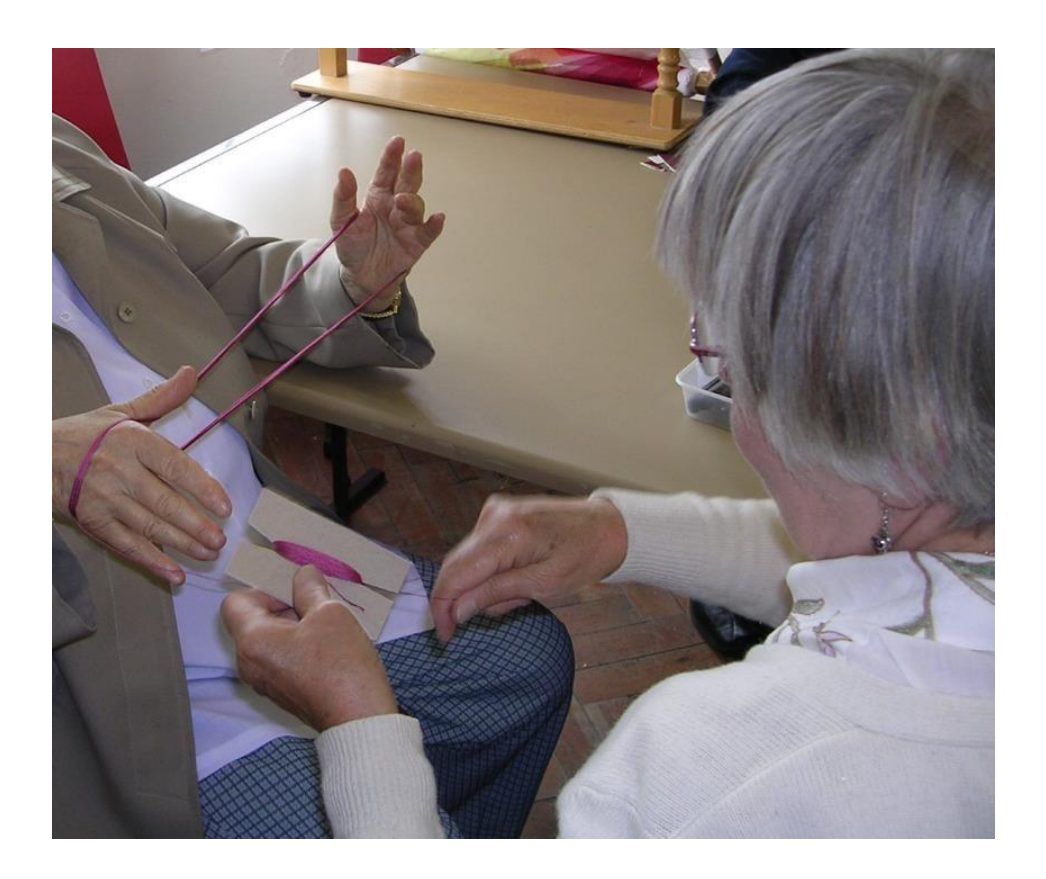
Figure 2: Thread winding: preparing skeins of embroidery thread to be used by several stitchers.

The conversation and the embroideries are jointly produced. The rhythms of one influence the rhythms of the other and the design of the process makes possible these parallel activities. Jones describes the reciprocity of women's speech as 'contemplated, rather than argued' (Jones 1990: 246), where each participant contributes to and takes from a shared pool of common experience. This mutually supportive function of women's speech is reflected in the design of the embroidery project. The different components are considered in such a way that tasks allotted to each participant can be adapted to their varied amounts of disposable time, their varied skill levels and the probability of them acquiring new skills and improving as they work. For instance, thread winding always needs to be done; it is a quick and simple task easily done by participants with less time to spare or limited ability (see Figure 2).