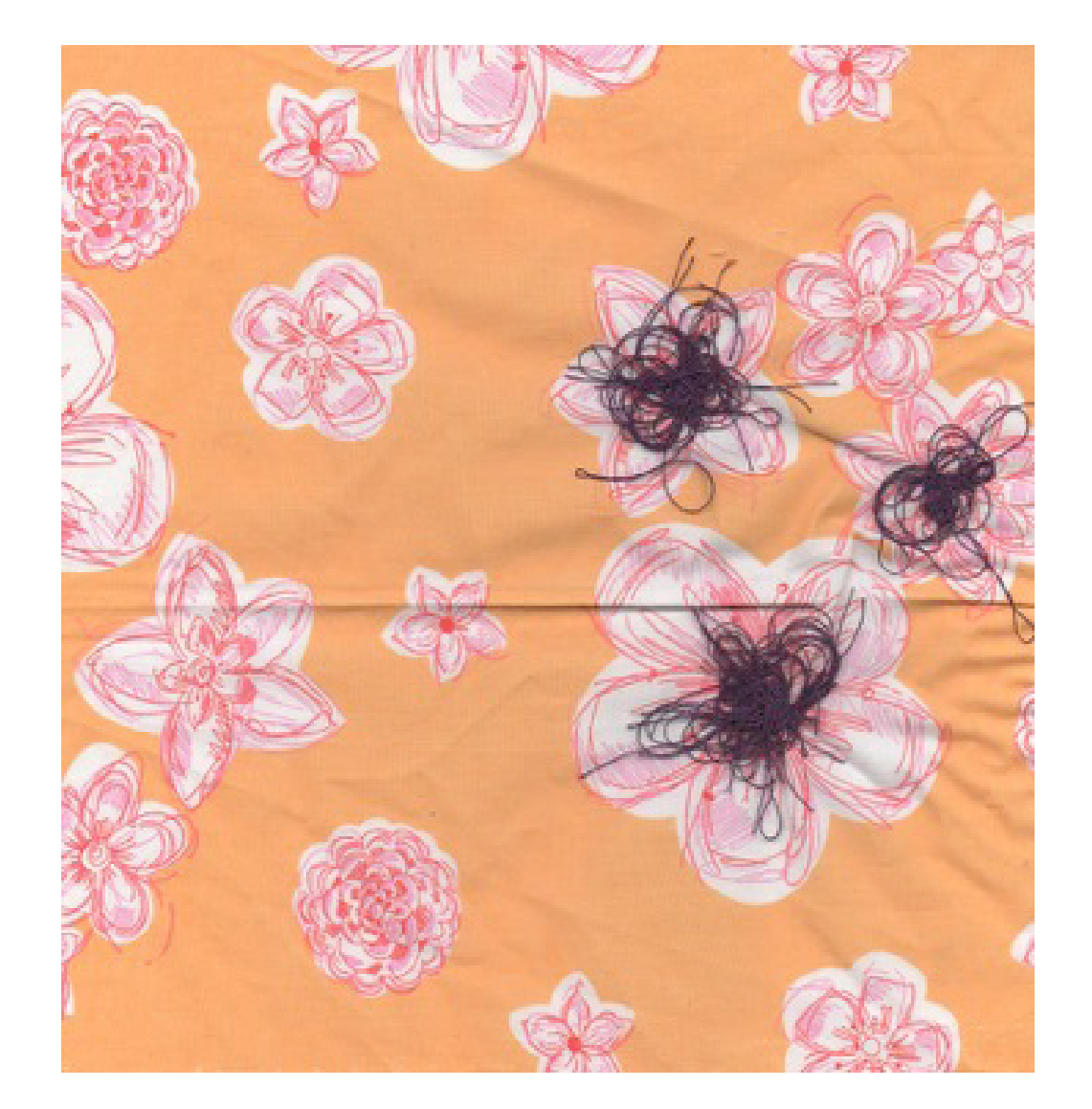
Figure 5 / Activity 2: Personal responses to found fabrics. A participant's attempt to overpower the material with her stitching in order to transform it.

Shercliff found devising specific workshop tasks to be an effective way of exploring in depth a variety of perspectives on a precise aspect of her research. Both workshops involved small numbers of participants and a high level of trust and intimacy, which enabled her to probe the participants' responses to her questions, resulting in richly detailed conversations containing raw interpretations of their making tasks. Crucially, her own personal and practical knowledge and experience of stitching enabled her to design making tasks that were likely to prompt interesting conversation.