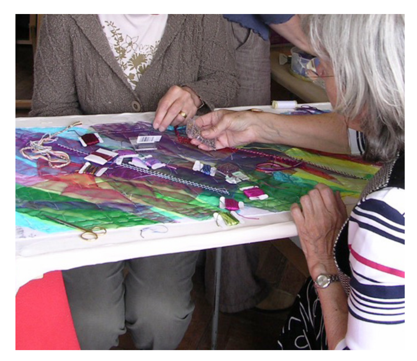
Figure 1 / Activity 1: collective stitching in the embroidery group.

This section focuses on aspects of Shercliff's research as a case study, documenting and evaluating three of the group making activities that she carried out: participation in an embroidery group with regular monthly meetings over two years (Activity 1 in the case study); tightly planned workshops designed to explore a specific question (Activity 2 in the case study); and a commission that arose during the project which was incorporated into the research (Activity 3 in the case study). By describing this case in detail, the authors were able to examine the complexity and richness of one research context, yet draw out insights which they believe can be applied more broadly (Yin, 2003), helping them to develop a critical understanding of making with others as a distinct approach to research. Later on in this paper the discussion will be opened out after including three of Twigger Holroyd's activities (alongside the three of Shercliff's described here) in a table of comparison.