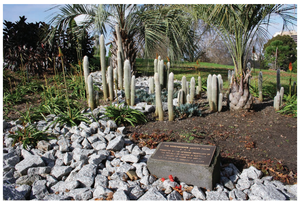
Figure 5. Remembrance Garden Palms in the Shrine Reserve presented by the Veteran's Federation of the Republic of Vietnam in Australia

1930s to the squabbles about separate memorials to the role of women over the past twenty years.