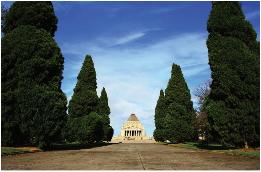
Figure 1. The Shrine of Remembrance in Melbourne, Victoria, Australia, approached along the avenue from the west. All photos: Suzette Worden, June 2014

'strung together into an iconographical programme or narrative'.<sup>3</sup> However, here the garden-as-mnemonic-text is at its most vulnerable. Over even a short period of time cultural references can be lost or displaced, and a 'proper' reading will be at the mercy of the linguistic sophistication and foreknowledge of subsequent generations. In addition, growth, decay and replacement will muddle the narrative intent. Over time even the most carefully arranged gardens face this erosion of their original purpose.