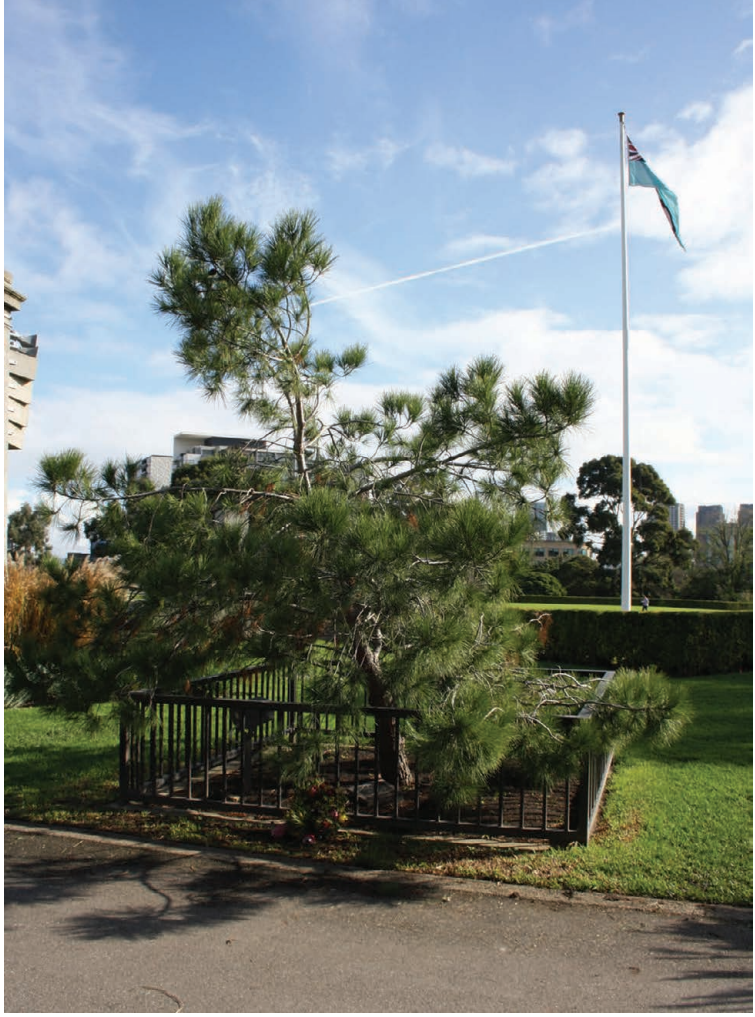
Figure 2. A 'Lone Pine' tree in the Shrine Reserve in Melbourne, planted on 24 April 2006 'in memory of the service and sacrifice of Victorians in the First World War'

English oaks, New Zealand Christmas tree, American elm and beech brought over from the Flemish battlefields. To augment further the scale and span of the British Empire, a Memorial Grove was planned around 'a nucleus [...] of trees from South Africa, Canada and India [...] terminating with an olive tree from Palestine'.<sup>46</sup>