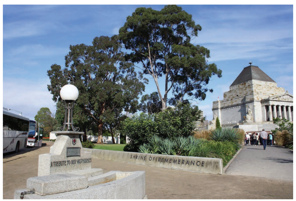
Figure 3. Visitors walking to the Shrine of Remembrance past the water trough memorial

With this proclamation in mind and with a clear emphasis on the emotional potency of 'solid earth', Monash forbade the siting of statues to war leaders in the immediate vicinity of the Shrine. Instead, the commemorative surround was planted with one hundred trees, each dedicated to a Victorian State military unit that had been engaged in the conflict. For decades, the trees served as places of commemoration for veterans and their descendants. Acting as surrogate graves, their trunks and footings were regularly strewn with wreaths, ribbons and personal mementos. They also became the focus of formal wreath laying services and ceremonies (Figure 4).