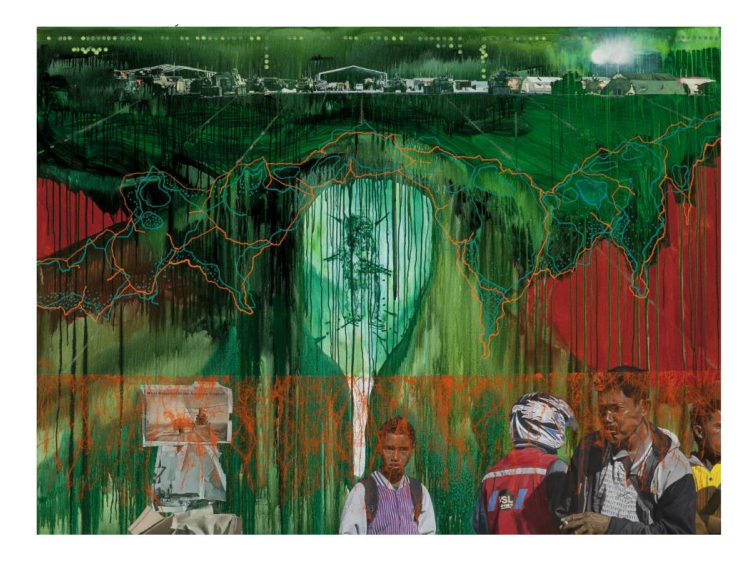
Figure 5. Lyndell Brown/Charles Green and Jon Cattapan, Spook Country (Maliana), 2014, oil and acrylic on linen, 185 \times 250 cm. Private collection.