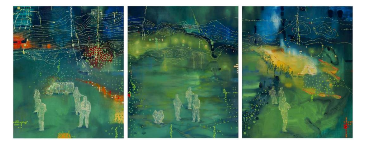
Figure 3. Jon Cattapan, Night Figures (Gleno), 2009, oil and acrylic on linen, 180 \times 250 cm. Private Collection.

This foreboding mood informed the cycle of paintings made on his return to Melbourne. The large and highly significant triptych, Night Patrols, Maliana (2009), is a compendium work that conflates many of the patrols and nocturnal places into something of a spectral gathering. We see similar pictorial concerns addressed in the triptych Night Figures, Gleno (Figure 3). 'The paintings in this series,' one reviewer wrote, 'are imbued with notions of anxiety and surveillance, and evoke in the viewer feelings of voyeurism and invasion of privacy.' The soldiers are observers but are also being observed. As they roam the benighted villages they too are being scrutinised and followed by unseen eyes. Luminous and larger than life, the soldiers seem at odds with the unfamiliar land, with its uncanny vivid greens and tracery of dots and lines. Every effort at integration and communication seems to be frustrated by their very alien presence, accentuated by their virulent painterly difference (Green et al. 2015, pp. 168–73).