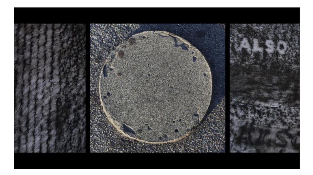
Figure 8. Paul Gough, Stoneology no. viii, 2017, charcoal, photo-montage and collage, 40 × 120 cm.