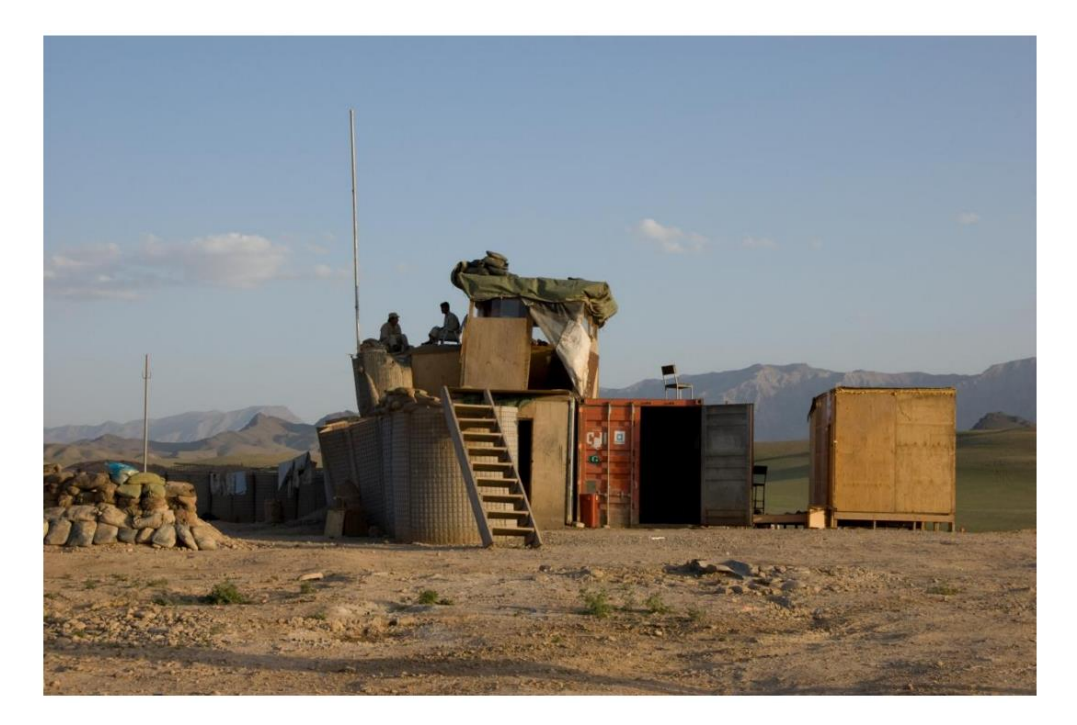
Figure 6. Lyndell Brown and Charles Green, Afghan National Army Perimeter Post with Chair, Tarin Kowt, Uruzgan Province, Afghanistan, 2007–2008, editioned digital colour photograph, inkjet print on rag paper, 111.5 × 151.5 cm. Collection National Gallery of Victoria.

Few have defined the diffuse spatiality of the post-modern battlefield better than Australian War Memorial curator Warwick Heywood: