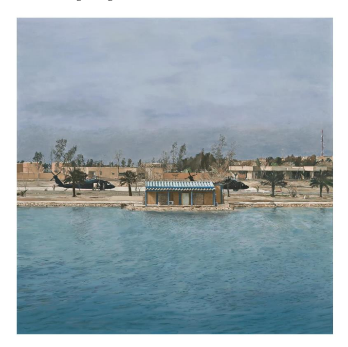
Figure 4. Lyndell Brown and Charles Green, The Dark Palace 1 , 2011, oil on linen, 151 \times 151 cm. Private collection.

Their response to their period in and around the 'front' line was a suite of contemplative, realist paintings and, by contrast, painterly photographs of the paraphernalia and infrastructure of a nebulous new warfare—huge bases, hardware technologies, fleets of armoured vehicles, soldiers preparing for patrol. In one painting a troupe of American drone pilots high in the Afghan mountains proudly showed off their weird craft; in another a squadron of attack helicopters is neatly parked inside a huge compound, immortalized in The Dark Palace 1 , 2011 (Figure 4). At the intersection of landscape, culture, and technology, these gravely quiet, almost frozen fragments of conflict were, as the artists noted, 'a portrait of force, of the hard edge of globalisation' (Brown and Green 2008).