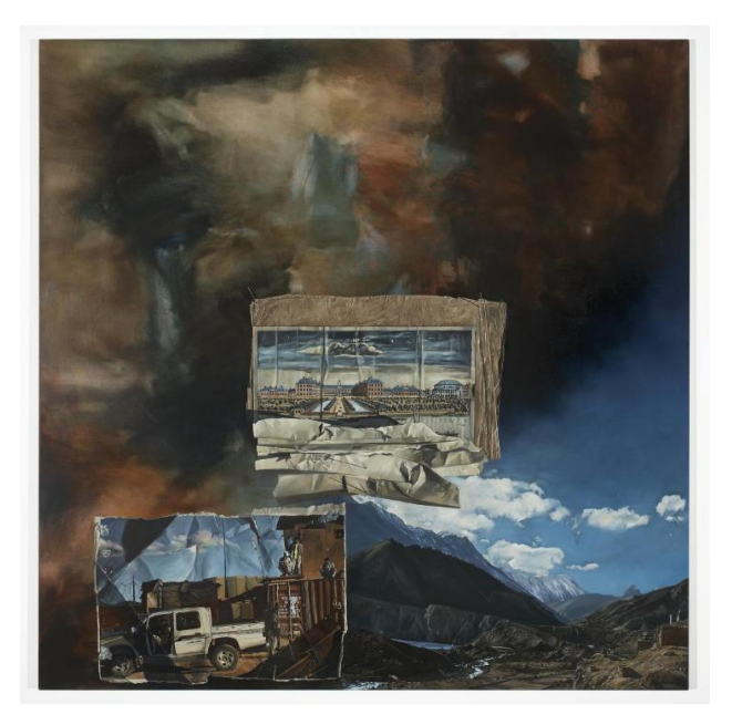
Figure 2. Lyndell Brown and Charles Green, Outpost , 2011, oil on linen, 170 \times 170 cm.

Since the late 1980s, war museums, most notably the Imperial War Museum in the United Kingdom, began commissioning contemporary artists who moved beyond traditional expectations that war art should depict martial action and valour. Canada, New Zealand and Australia moved in