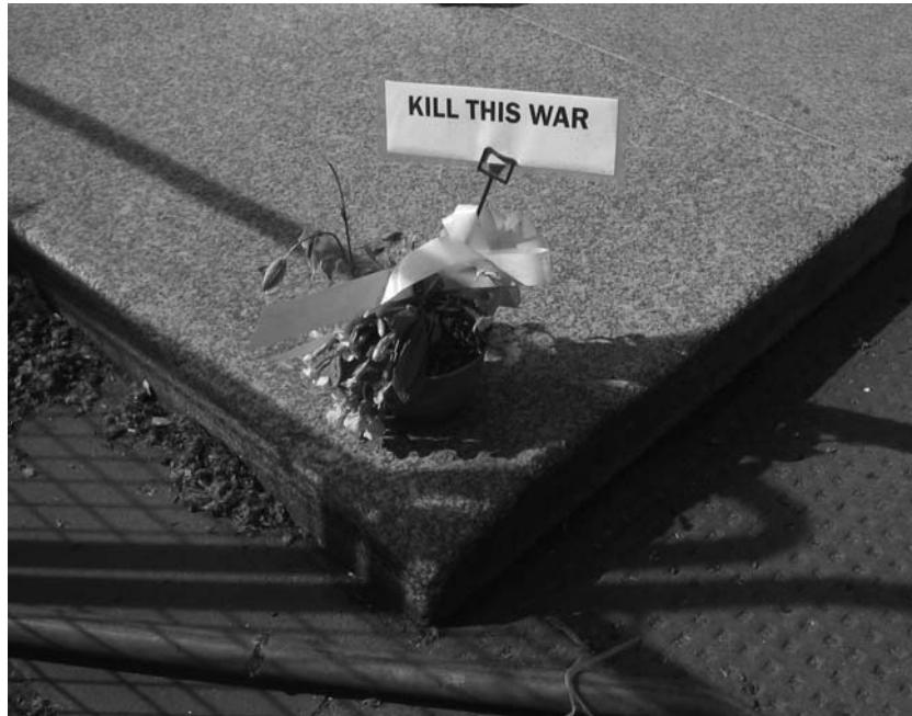
Figure 5: Flowers, left at the Cenotaph, Whitehall, April 2004.

idea. She had certainly seen off tougher debaters than me, and was one of those people who answer each question with a negative. 'No. We have raised the money, thousands of women in this country have contributed. No. It is an essential project.' In parallel monologue we debated a little further, but she would brook no opposition, no sympathy with my counter-monument proposals: a garden, an annual festival, a national scholarship scheme, a big idea that would engage with the 'process' of remembering, something inclusive and participative. It smacked of being 'alternative' - not in the sense of a different choice, just too tricky, too subtle, lacking substance. 'No. We will realize this vision in bronze and stone.' Or was it 'stone and bronze'? I left the studio convinced it would never happen. Not after Lady Di and the empty plinth, not after the national memorial garden, and the tons of bouquets in St. James's Palace.