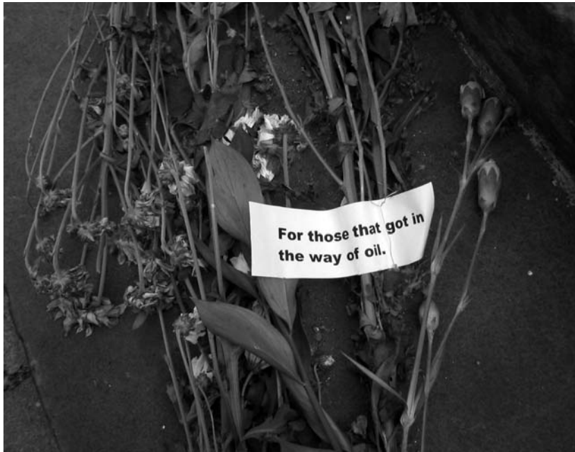
Figure 3: Bouquet, left at the Cenotaph, Bristol, April 2003.

the semiotics of commemorative spatiality are complex because, as Bender points out, spaces are 'political, dynamic, and contested' and so 'constantly open to renegotiation' (Bender 1983: 276).