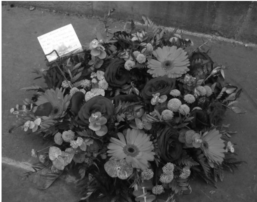
Figure 1: Wreath left at the Cenotaph, Bristol, March 2003.

Fieldwork in northern France, Canada and Turkey was made possible by a Canadian Government research grant in 1999–2000 and by an Arts and Humanities Research Council grant in 2005. See http://www.vortex.uwe.ac.uk/ .