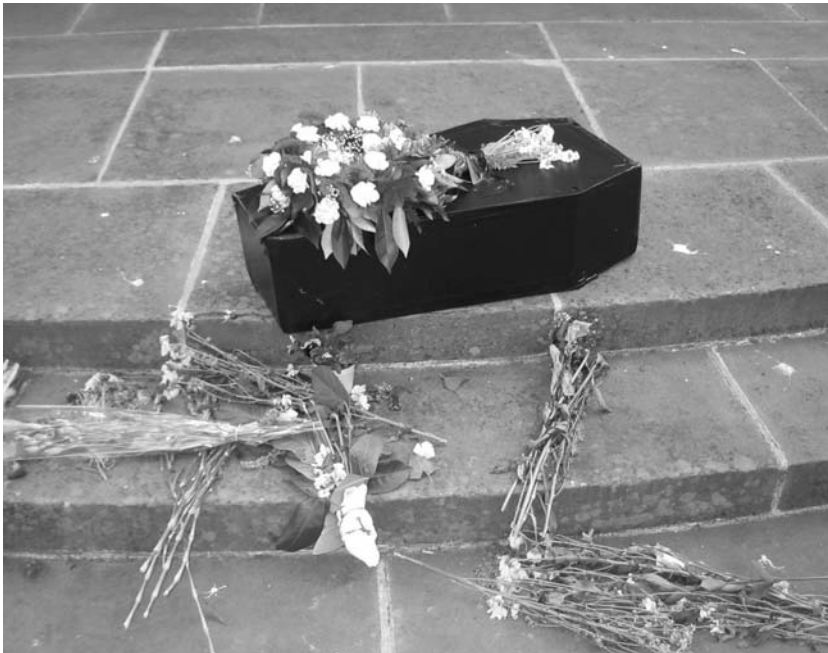
Figure 2: 'Coffin', left at the Cenotaph, Bristol, April 2003.

Fixed statues, the 'heroes on horseback', the idols and the exalted induce not awe but a reified memory that quickly results in national amnesia (Young 1992). Memory is fluid and contingent and, as many contemporary European artists have pointed out, it is neither possible nor desirable to insist on a single, objective and authoritative reading of any one place or historic moment. The counter-monuments created in post-unification Germany are designed 'to register protest or disagreement with an untenable prime object' - the plinth-bound, exalted statue - and to set up a process of reflection and debate, however uncomfortable or radical (Michalski 1998: 207). Analysing what he refers to as the western 'anxiety of erasure' engendered by bourgeois culture, Lacquer has asserted, in a similar vein, that figurative simulation has long been inadequate to the task entrusted to it. Instead, 'the thing itself must do because representation can no longer be relied on' (Lacquer 1996).