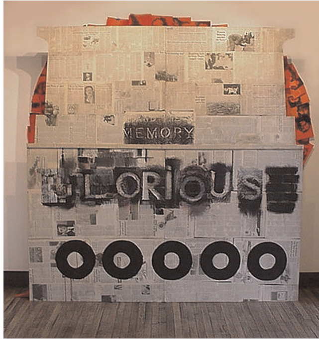
FIGURE 1 Faux Cenotaph, Watershed Media Centre, Bristol, 2001.

on the theoretical work of Boyer (1996) and Matsuda (1996), we explore the contested dialogues of commemoration as acts that go beyond evaluation, judgment, and of utterance, to become dialogic, interventionist and ( in extremis ) auto-destructive.