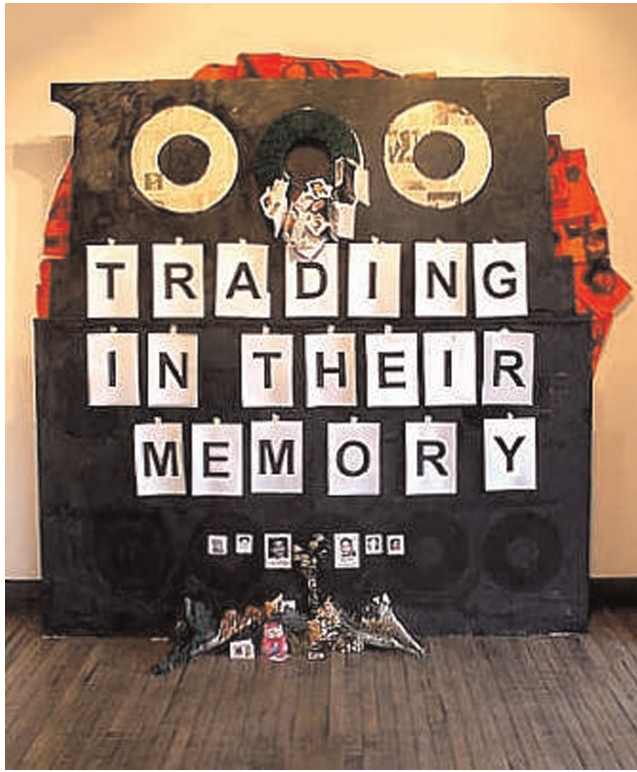
FIGURE 4 Faux Cenotaph, Watershed Media Centre, Bristol, 2001, second intervention.

hanging from the walls of a conventional exhibition venue. Comments in the Visitor's Book at this venue were more conventional appreciations (or otherwise) of the draughtsmanship of the work or their value as exhibited artefacts. In parallel, the online 'conversations' between the academics and the artists addressed the almost daily changes to the 'Faux Monument', seeking urgent updates and, at times, challenging the artist to take some sort of stand against the interventionist (s). One of the more pointed observations from a US colleague suggested that something 'had gone terribly wrong' with the show and that the artist had conceded any say over his own artwork. Others felt very differently, arguing that the dialogic nature of the piece was fresh, stimulating, and necessary.