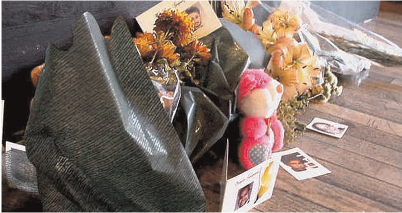
FIGURE 7 Faux Cenotaph, Watershed Media Centre, Bristol, 2001, fourth intervention, detail.

still focused on whether any loss of creative autonomy had resulted from these unscripted interventions. By his account, the artist did not feel that he, or his work, had been violated by these intrusions, but had actually been enriched by its polyvocality, even if these voices were hidden and obscure.