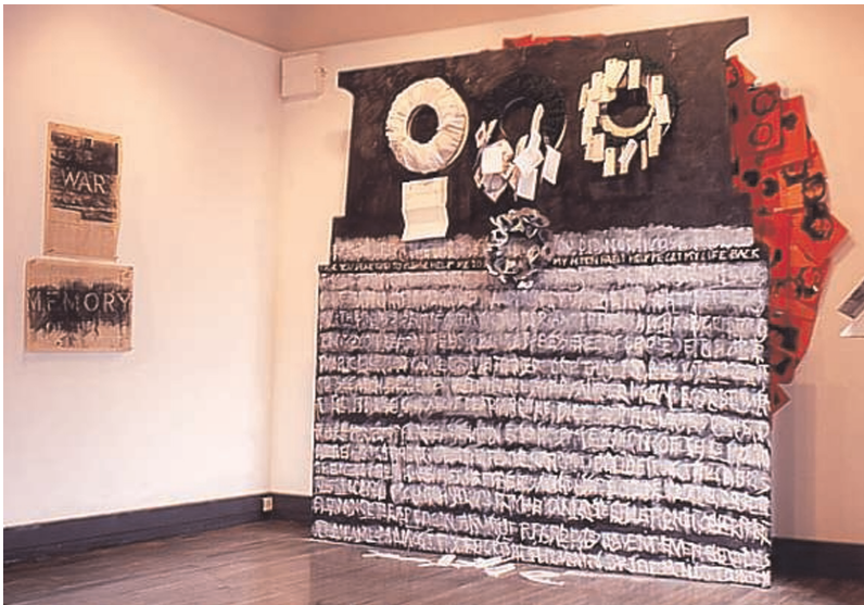
FIGURE 9 Faux Cenotaph, Watershed Media Centre, Bristol, 2001, sixth intervention.

Matsuda has suggested that commemoration is an act of evaluation, judgment, and of utterance. The Faux Cenotaph at the Watershed, originally intended to illustrate the notion of monument as monologue, found itself, through an extraordinary coincidence of timing, engaged in the ‘polemics of commemoration and anti-commemoration’ a situation common to many public artworks in times of extremis (Matsuda, 1996: 6). Situated, like many war memorials, in a public place, the artwork was unlike many public monuments in that it seemed to invite intervention or participation. Perhaps because of its obviously temporary and contingent nature and its subsequent inability to claim ‘perpetuity’ or ‘authority’, it became a conduit for public comment on a contemporary and momentous political situation (Gough & Morgan, 2004).