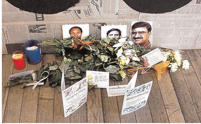
FIGURE 5 Faux Cenotaph, Watershed Media Centre, Bristol, 2001, third intervention.