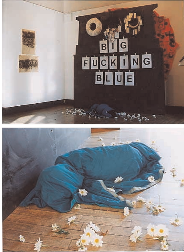
FIGURE 8 Faux Cenotaph, Watershed Media Centre, Bristol, 2001, fifth intervention.

whether a second generation of mourners inherits the earlier meanings attached to the place or event, and brings new meanings or fresh layers of interpretation. Without frequent social re-inscription the key determinants of commemoration simply fade away: memory atrophies, the monument loses its potency and relevance. As Mumford (1938: 438) tellingly asserted, it becomes ‘invisible’ and stays so. The ‘Faux Monument’ had deliberately been situated in a public space passed by hundreds of people every day. Like most pieces of civic statuary it was expected to be ignored and to remain unseen for its 6-week temporary residency. Perhaps it would have done had it not been willfully, and radically, re-invigorated over the weeks by clandestine hands.