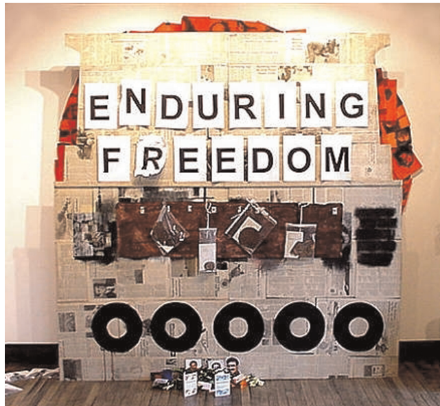
FIGURE 3 Faux Cenotaph, Watershed Media Centre, Bristol, 2001, first intervention.

Within a short while the ‘R’ had been ripped down, crumpled up and thrown to the foot of the artwork, so creating a new ‘inscription’ — ‘F_EEDOM’ — that referred once again to commercial transaction. A few days later these were replaced with fresh sheets spelling out, ‘Trading in their Memory’ (a letter apiece laser-printed onto single A4 sheets of paper) pinned up on the face of the ‘monument’ (Figure 4). During this period of its showing even the Comments Book (which had been placed adjacent the edifice) became a part of its function as a collective, informal, Denkmal , or guerilla-memorial. It contained phrases that condemned the bombings in Afghanistan and the US war on terrorism, with exhortations such as, ‘this can’t go on’ and ‘stop the bombing’. By comparison, the exhibition of drawings at the other venue—The Architecture Centre—was attracting none of this attention, largely, one surmises, because it was a show of framed pieces of art