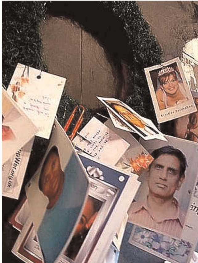
FIGURE 6 Faux Cenotaph, Watershed Media Centre, Bristol, 2001, fourth intervention, detail.