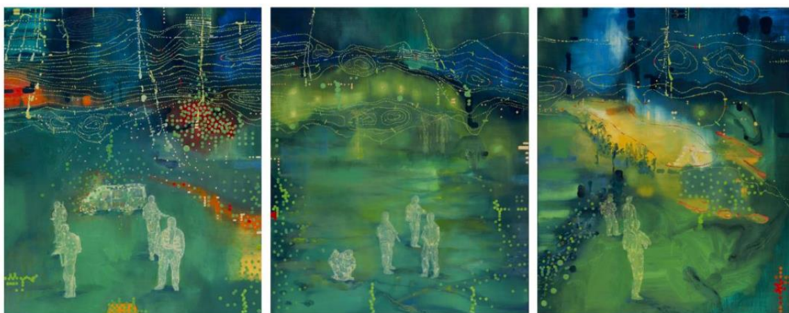
Figure 3. Jon Cattapan, Night Figures (Gleno) , 2009, oil and acrylic on linen, 180 × 250 cm. Private Collection.

This foreboding mood informed the cycle of paintings made on his return to Melbourne. The large and highly significant triptych, Night Patrols, Maliana (2009), is a compendium work that conflates many of the patrols and nocturnal places into something of a spectral gathering. We see similar pictorial concerns addressed in the triptych Night Figures, Gleno (Figure 3). 'The paintings in this series,' one reviewer wrote, 'are imbued with notions of anxiety and surveillance, and evoke in the viewer feelings of voyeurism and invasion of privacy.' The soldiers are observers but are also being observed. As they roam the benighted villages they too are being scrutinised and followed by unseen eyes. Luminous and larger than life, the soldiers seem at odds with the unfamiliar land, with its uncanny vivid greens and tracery of dots and lines. Every effort at integration and communication seems to be frustrated by their very alien presence, accentuated by their virulent painterly difference (Green et al. 2015, pp. 168–73).