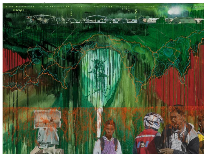
Figure 5. Lyndell Brown/Charles Green and Jon Cattapan, Spook Country (Maliana) , 2014, oil and acrylic on linen, 185 × 250 cm. Private collection.