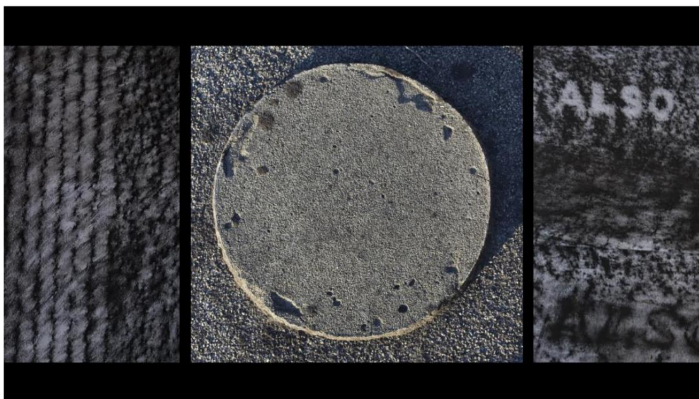
Figure 8. Paul Gough, Stoneology no. viii , 2017, charcoal, photo-montage and collage, 40 × 120 cm.