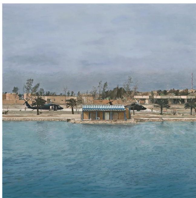
Figure 4. Lyndell Brown and Charles Green, The Dark Palace 1 , 2011, oil on linen, 151 × 151 cm. Private collection.

Their response to their period in and around the ‘front’ line was a suite of contemplative, realist paintings and, by contrast, painterly photographs of the paraphernalia and infrastructure of a nebulous new warfare—huge bases, hardware technologies, fleets of armoured vehicles, soldiers preparing for patrol. In one painting a troupe of American drone pilots high in the Afghan mountains proudly showed off their weird craft; in another a squadron of attack helicopters is neatly parked inside a huge compound, immortalized in The Dark Palace 1 , 2011 (Figure 4). At the intersection of landscape, culture, and technology, these gravely quiet, almost frozen fragments of conflict were, as the artists noted, ‘a portrait of force, of the hard edge of globalisation’ (Brown and Green 2008).