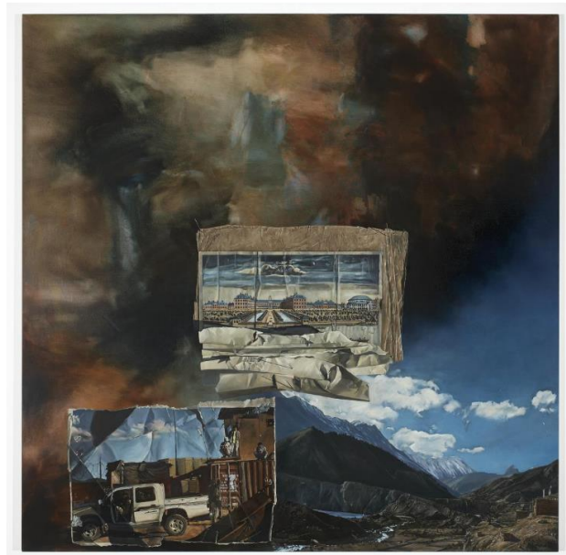
Figure 2. Lyndell Brown and Charles Green, Outpost , 2011, oil on linen, 170 × 170 cm.

Since the late 1980s, war museums, most notably the Imperial War Museum in the United Kingdom, began commissioning contemporary artists who moved beyond traditional expectations that war art should depict martial action and valour. Canada, New Zealand and Australia moved in