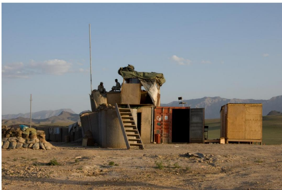
Figure 6. Lyndell Brown and Charles Green, Afghan National Army Perimeter Post with Chair, Tarin Kowt, Uruzgan Province, Afghanistan, 2007–2008 , editioned digital colour photograph, inkjet print on rag paper, 111.5 × 151.5 cm. Collection National Gallery of Victoria.

Few have defined the diffuse spatiality of the post-modern battlefield better than Australian War Memorial curator Warwick Heywood: