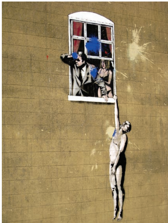
Figure 7: Banksy, Well Hung Lover, Park Street, Bristol, photographed 2010.