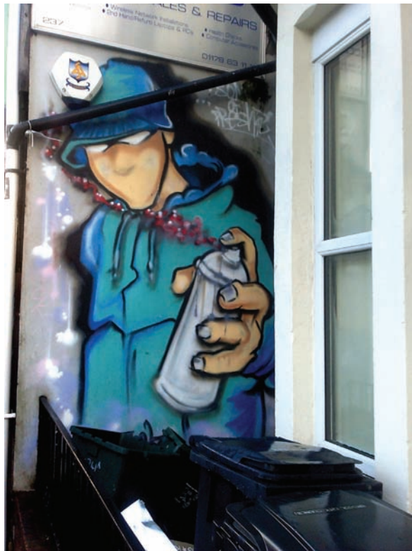
Figure 1: Anon., Tagger (2015), North Street, Southville, Bristol.