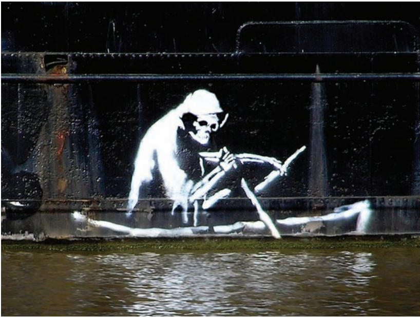
Figure 5: Banksy, Grim Reaper, Thekla boat, Bristol Harbour, photographed 2009.