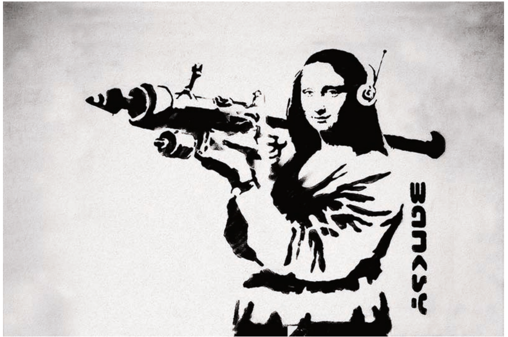
Figure 3: Banksy, Mona Lisa touting a Milan Missile Launcher, photographed 2008 © Pest Control Office.