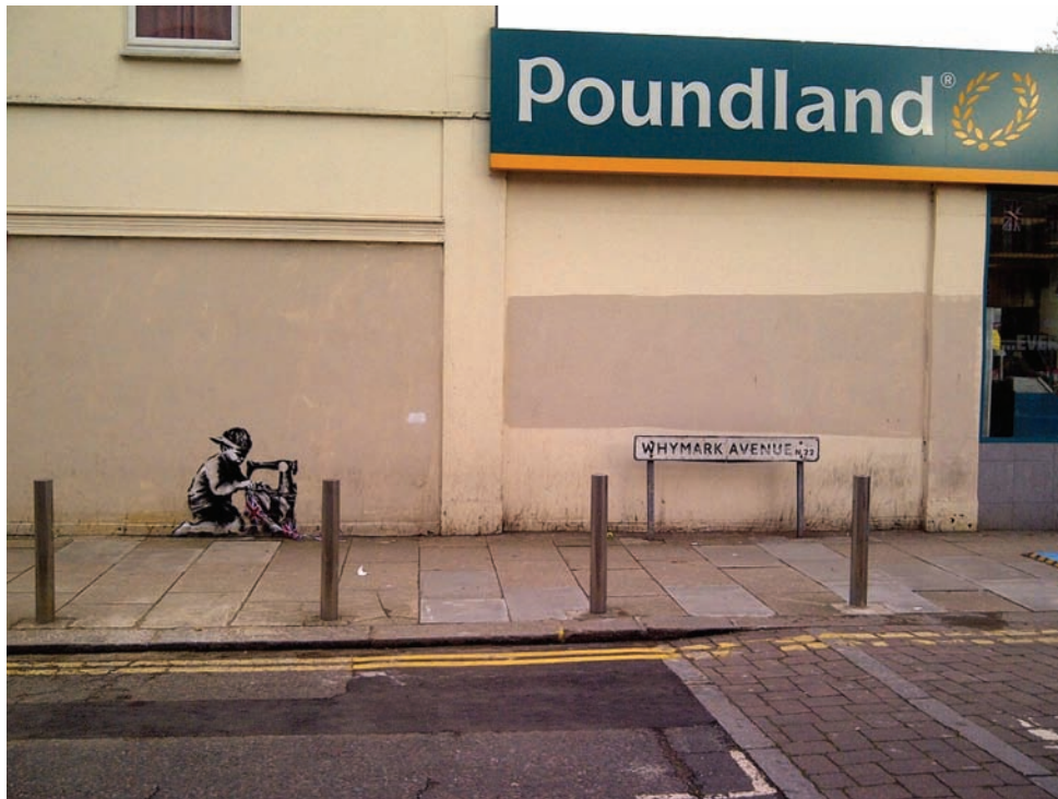
Figure 8: Banksy, Slave Labour, Poundland Store, Wood Green, London, photographed 2012.