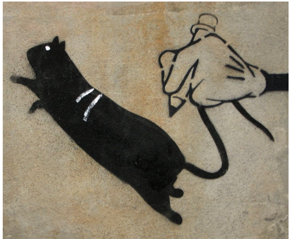
Figure 2: Blek le Rat (2012), street stencil, Paris.