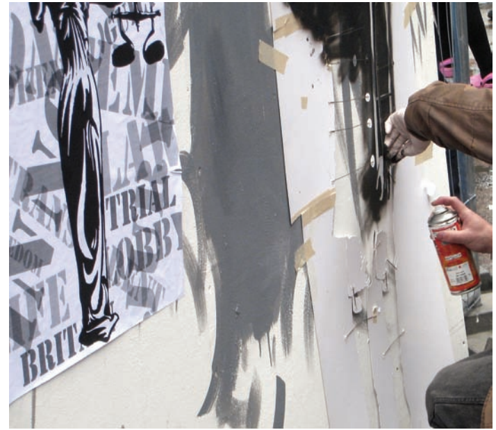
Figure 6: Stenciller, Urban Paint Fest (UPFest), Bristol, May 2014.