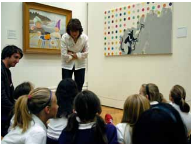
Damien Hirst and Local Artist: 2009. Children on a school visit are introduced to Banksy's work at Bristol Art Gallery.

They don't, however, tell the full detail of the story and neither should we expect to have it revealed. Anonymity is essential to the Banksy myth. Still, it would have been fascinating to know how he and his crew managed to drag and assemble an ice-cream van into the lobby of the museum, or how they actually placed the orange-suited Guantanamo Bay figure in the middle of the flimsy balsa-wood box aeroplane that hovers over the main entrance. The 'How Did He Do That?' questions were never answered, nor did I really expect them to be. The curators had entered into a pact with Banksy and his crew which they did not want to compromise, not least because they might want to work with him and his team again, but primarily because they respected him and his team of fabricators, decorators, animatronic-ists, and installation professionals. A 'reveal' was not going