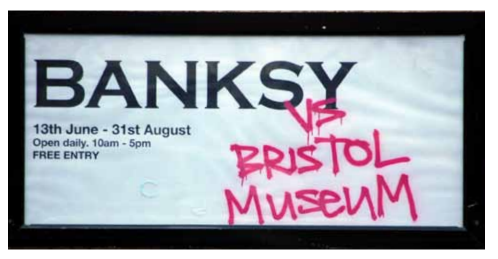
The Queen's Road poster for the ground-breaking Banksy exhibition.

By contrast every word in this book is authentic; the authors happy to reveal themselves and to share their reflections of the show and its aftermath. The aim of this book was not to reveal the identity of the artist, nor to uncover how the show was created, although some of the contributors hint at both. Its aim was to try to evaluate the legacy of the show, to ask if there was an estimable impact, a lingering influence on Bristol, on its culture, on the