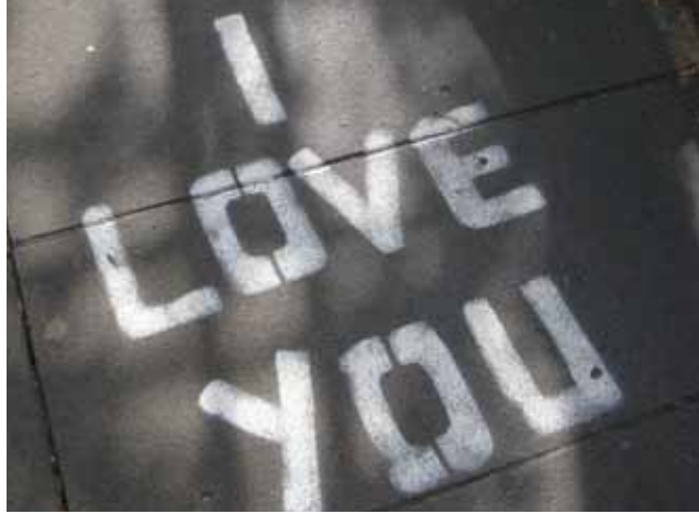
I love you : another example of a random stencil in central Bristol, Gaol Ferry Bridge, Bristol

During the making of this book I heard a great many such stories, freely and generously re-told, often richly embellished, and resonating in ways that one would never expect to hear about 'conventional' pieces of art in a gallery. Many of these personal narratives (indeed some of the contributions in this book) were offered by people who had heard of the project and wanted, in some way, to be part of it. One woman volunteered this tale: