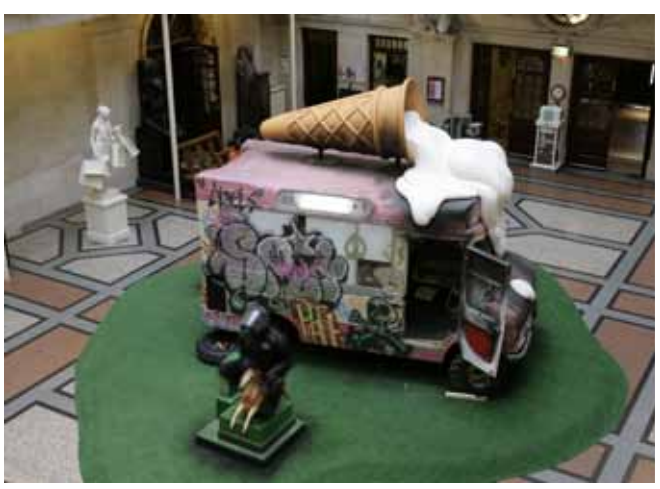
The sight that greeted unsuspecting museum staff arriving for work on the opening day. The choice of ice-cream van was not random or a mere whimsy. In a BBC Radio 4 documentary on ice-cream vans (30 July 2011) Banksy, his voice heavily disguised, recalled with affection 'the classic Bedford, gloopy tiny little row of headlights shining out from a droopy bonnet; yeah, it was made for selling ice-cream right? Because it looked like one.' Adding, with characteristic edge, 'it was a childhood thing gone wrong, really; slight loss of innocence, the broken shards of a burnt-out husk of Britain – but still with a soft centre.'

Given the eventual success of the show it's now hard to remember the actualities of the time. The stakes were high on both sides. Not only had the cultural chiefs closed their flagship building for over 48 hours without being able to tell their own staff why, but they had allowed what some might regard as a motley crew of hooded youth and 'urban guerillas' the freedom to roam at will amongst galleries of rather expensive paintings, rooms full of historic artefacts, and the largest collection of Chinese ceramicware in Europe. And, of course, they had no idea what to expect when the doors were opened to the public. In the end the top team at the museum - Paul Barnett, Kate Brindley, Tim Corum and Phil Walker - pulled it off and their story is told in this book.