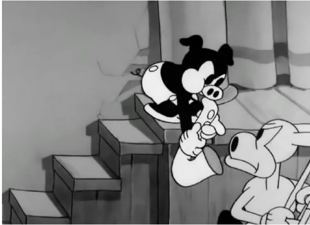
Figure 1. Piggy confronts an in-house musician through song in You Don't Know What You're Doin' (1931). Screen grab from DVD (Looney Tunes Golden Collection: Volume 6, Disc 3, Rudolph Ising, Warner Bros.).

Bosko, who could be seen serenading his girlfriend amongst other musical antics. It was not just the characters who would dance, but buildings sway, the horizon line bounces and nearly every object comes alive to the beat of the music. Imagery often reacts to, or appears governed by non-diegetic music, thus problematizing distinctions between the diegetic and non-diegetic sound (Curtis, 1992: 201).