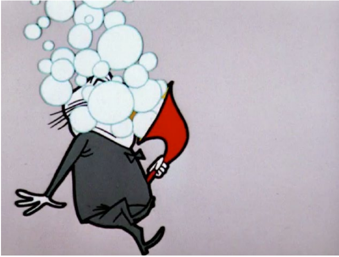
Figure 2. A ‘laughing bubble attack’ in Now Hear This (1962). Screen grab from DVD (Looney Tunes Golden Collection: Volume 6, Disc 4, Chuck Jones, Warner Bros.).

feelings associated with the events depicted. Hence, characters dig their heels into the ground when coming to an abrupt stop and they are sonically accompanied by a car tyre screeching to a halt. The application of particularly bold uses of rendering is perhaps afforded by the artificial-by-nature character of stylized animations.